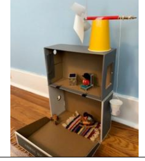
Figure 1. House with wind-powered elevator.

The wind-powered "elevator" uses a rotating pinwheel attached to a pencil to lift a small paper cup. To make the pinwheel (see Figure 2), take a square piece of paper, cut in along the diagonals toward the center (but stopping within about 1 cm from the center), fold one corner of each section into the center, and fasten these corners with tape.